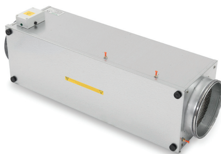
Air Cleaner CC 400 Concealed Art. number: 94000080

EXAMPLE OF A CC 400 CONCEALED BEHIND FALSE CEILING